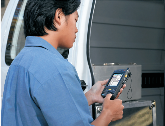
Easily develop applications that enable service personnel to access back-end systems in the office to check service level, capture costs and submit billing information in real time.