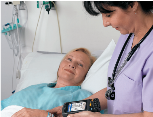
The ability to create mobile applications that integrate bar code scanning can enable retail managers to audit pricing, warehouse workers to collect real-time inventory information, and healthcare workers to scan patient wristbands to ensure the right patient receives the right tests and medication — improving the overall quality of patient care.