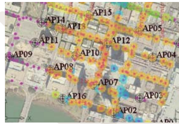
Visualize the network coverage