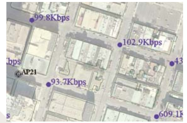
Display the throughput data rate

When used with Motorola's SiteSpy software, BroadbandScanner's AP performance feature provides a unique capability to generate network traffic and assess real application-level throughput without the need for an active Internet backhaul connection. As a result, post-deployment teams can verify and troubleshoot AP link connectivity, packet latency, data throughput, and connections to the NOC (Network Operations Center) before connecting live to the outside world.