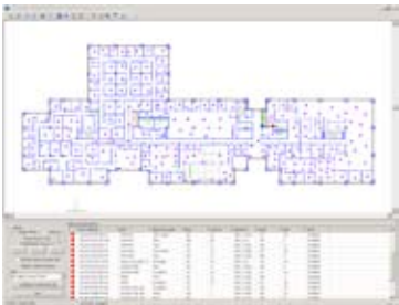
Survey the deployed network to validate performance