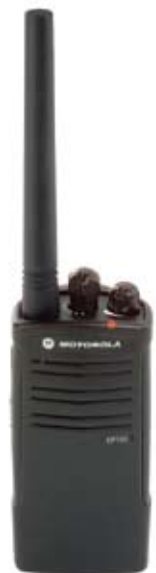
EP150 VHF model

Weighing just 8.6 ounces, the EP150 is comfortable to wear all day. Plus, the user interface makes the radio simple and easy to use with little or no training.