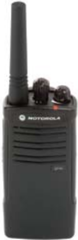
EP150 UHF model

Designed To Meet Hospitality Managements' Needs