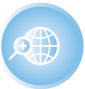
MOTOTRBO Location Services