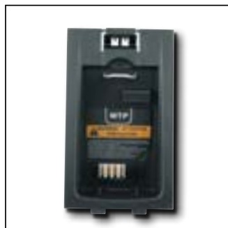
NNTN6846 Battery Pocket Insert (for Multi Unit Charger)