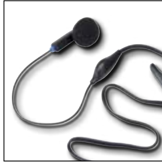
FTN6583 Bud Ear Piece with In-line Microphone and PTT