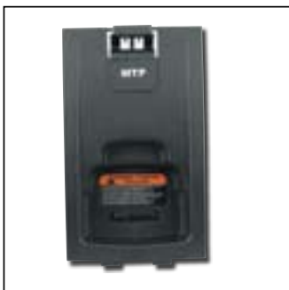
NNTN6845 Radio Pocket Insert (for Multi Unit Charger)