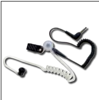
RLN4941 Receive Earpiece with Translucent Tube