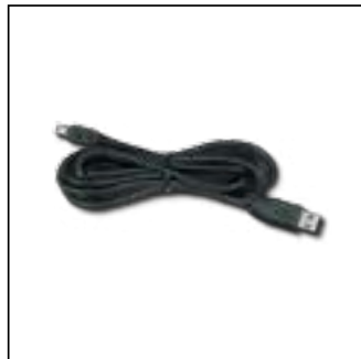
SKN6371 Mini USB Data Cable for Programming Pockets NNTN6848 or NNTN6849 (one required per programming pocket)