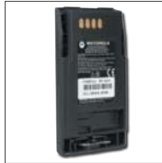
FTN6573 950mAh Lilon Slim-line Battery