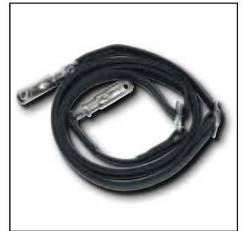
NTN5243 Carry Case Shoulder Strap