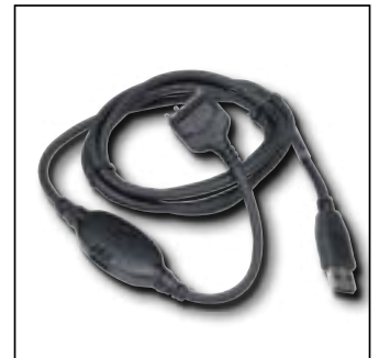
PMKN4026 USB Programming Cable