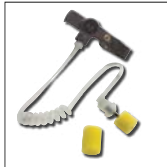
RLN6230 Acoustic Tube for extreme noise environments (use with FTN6595)