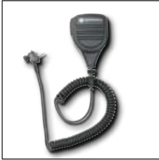
PMMN4015 Remote Speaker Microphone with Duress button and Ear Jack