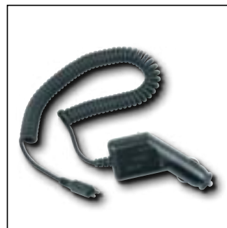
FLN9469 In-vehicle Charger (for cigarette lighter charge)