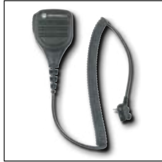
PMMN4057 High Audio Output Remote Speaker Microphone with Duress Button, but no Ear Jack