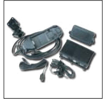
GMLN4687 MTP850 Car Kit - Voice Only (excludes antenna)