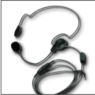
FTN6582 Breeze Head Set with Boom Microphone and In-line PTT