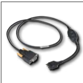
FLN9636 RS232 Programming Cable