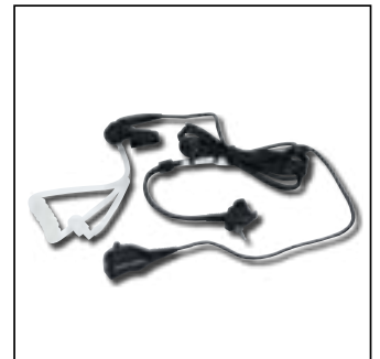
PMLN5642 2-Wire Surveillance Kit with Acoustic Tube, Black