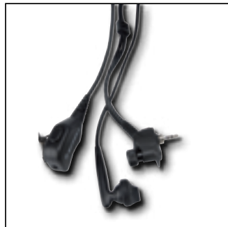
FTN6707 2-Wire Surveillance Kit