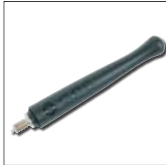
8587526V08 Whip Antenna, 806 - 870 MHz MAX, GPS