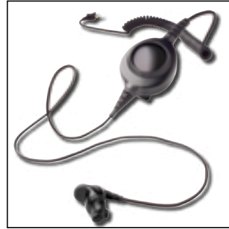
PMLN5561 Bone Conduction Ear Microphone with Large PTT