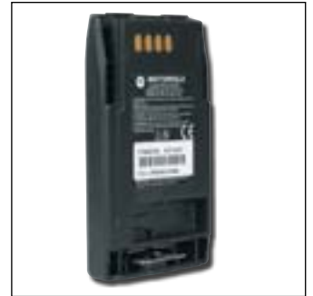
FTN6574 1850mAh Lilon High Capacity Battery