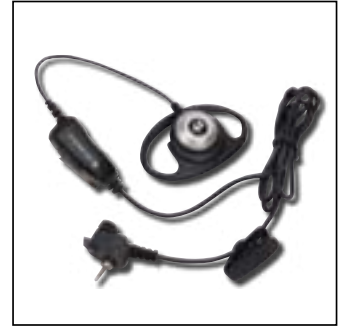
PMLN5272 D-Shell (small) Earpiece with In-line Microphone and PTT