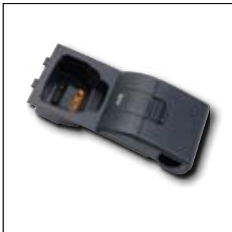
NNTN6848 USB Radio Programming Pocket Insert (Pack of 6 - NNTN6849)