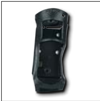
RLN5717 Hard Leather Carry Case with Swivel 2" Belt Loop, D-rings