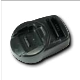
FTN6575 Dual Slot Desktop Charger (base only)