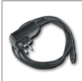
PMLN4962 Wall-socket Charger (with Australian adaptor - compatible with Desktop Charger FTN6575)