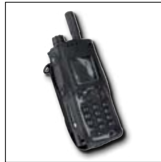
RLN5720 Soft Leather Carry Case with Integrated Belt Clip, D-rings