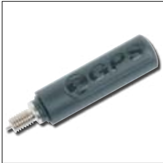
8587526V08 Stubby antenna, 806 - 870MHz MAX, GPS