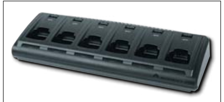
NNTN6903 Multi (6) Unit Charger (with Radio Pocket Inserts)