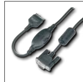
FKN4897 RS232 Data Cable (compatible to use with PMVN4124)