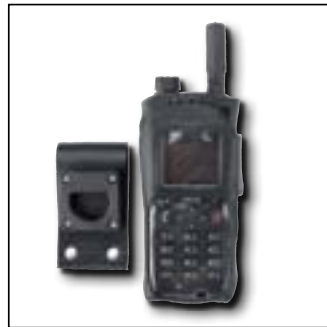
RLN5719 Soft Leather Carry Case with Swivel 2" Belt loop, D-rings