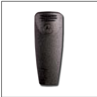
HLN9714 2.5" Belt Clip