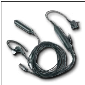
FTN6595 3-Wire Surveillance Kit