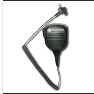
PMMN4066 Noise Cancelling Remote Speaker Microphone with Duress Button and Ear Jack