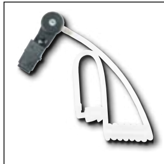
PMLN4605 Clear Coiled Audio Kit (use with FTN6707)