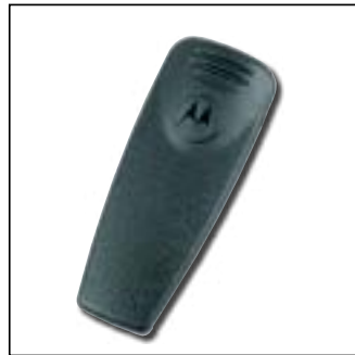
HLN9844 2" Spring Belt Clip