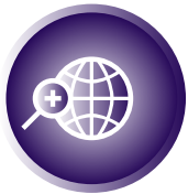
MOTOTRBO Location Services