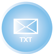
MOTOTRBO Text Messaging Services