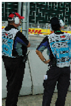
SGP F1 Crew seen using Motorola TETRA Radios

The prestigious F1 race calls for nothing less than an efficient and secure communication system to ensure the success of the event. As the first night motor race in Singapore, the organizers could afford no mistakes. Motorola was contracted by Valerio Maioli S.p.a to provide the TETRA (TERrestrial Trunked RAdio) system to support the communications needs of the maiden event.