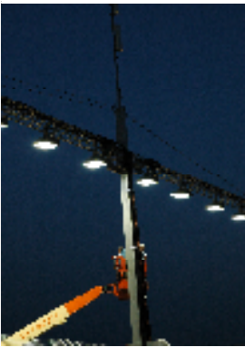
Antenna installation on a light tower

The prestigious F1 race calls for nothing less than an efficient and secure communication system to ensure the success of the event. As the first night motor race in Singapore, Motorola was contracted to provide the TETRA (TErrestrial Trunked RAdio) system to support the communications needs of the inaugural event.