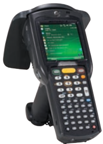
New enterprise-appropriate RFID readers reduce complexity and increase usability.