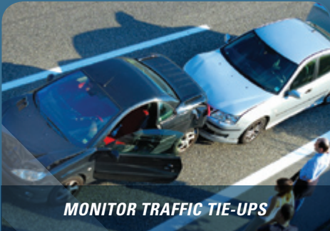
MONITOR TRAFFIC TIE-UPS

Just as the morning rush hour is beginning, a fender-bender in the middle lane of an expressway is causing a major traffic tie-up. A video camera mounted on a light pole sends real-time images of the situation to traffic control for immediate response.