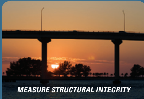
MEASURE STRUCTURAL INTEGRITY

Just as the morning rush hour is beginning, a fender-bender in the middle lane of an expressway is causing a major traffic tie-up. A video camera mounted on a light pole sends real-time images of the situation to traffic control for immediate response.