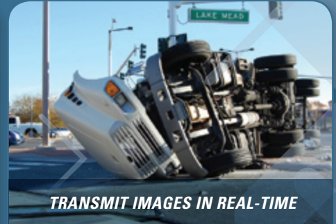
TRANSMIT IMAGES IN REAL-TIME

A four-lane causeway has served a populous coastal area well for almost 30 years. To help ensure its structural integrity, the department of transportation measures and monitors stress levels remotely via sensors and wireless broadband connectivity.